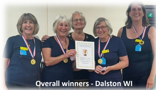
Overall winners - Dalston WI

Caldbeck 'A' Team and 3rd Santon Bridge 'A' Team. Well done Ladies!! Thank you to the AC & L committee and helpers for their time and help. We will be looking to have another next year - not necessarily the same format!