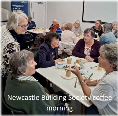
Newcastle Building Society coffee morning

May has been quite a busy month for the Federation, we began with a new venture, a coffee morning in the Newcastle Building Society Carlisle, which was well attended, thank you. That is the venue for our Quizzical Walk on Wednesday 8 th July with more details elsewhere in the magazine. We have been walking the streets of the city preparing the questions!