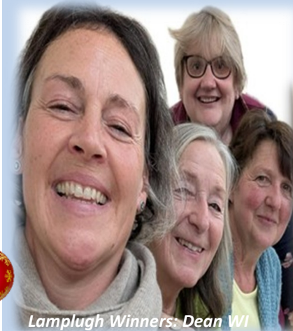
Lamplugh Winners: Dean WI