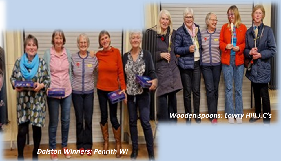
Wooden spoons: Lowry Hill J.C's