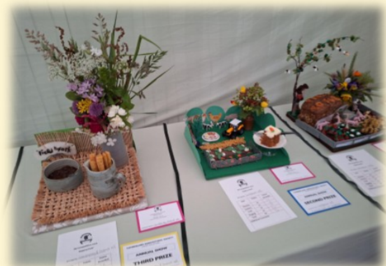
Previous show entries in this category