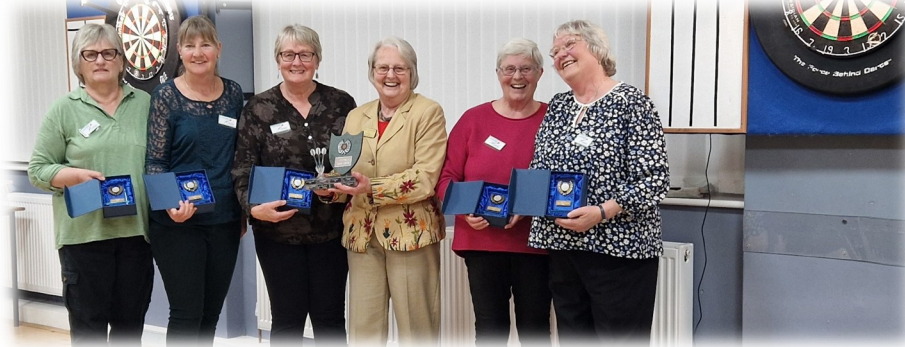
Winner of the Team Trophy Lazonby WI