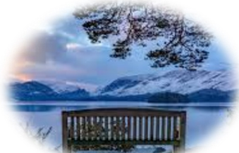
Friars Crag, Derwentwater